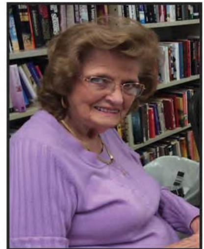
Looking Pretty Suzie Rousey